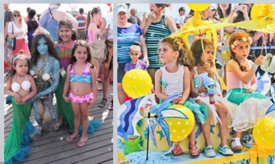
Caribbean Mermaid Parade September 23rd, 2017